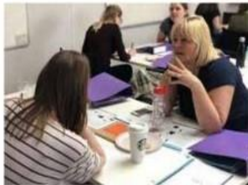
Teachers learn new ways that film can be used to help learning

other teachers from each school is being trained as part of the four-year programme. They will share what they have learned with colleagues.